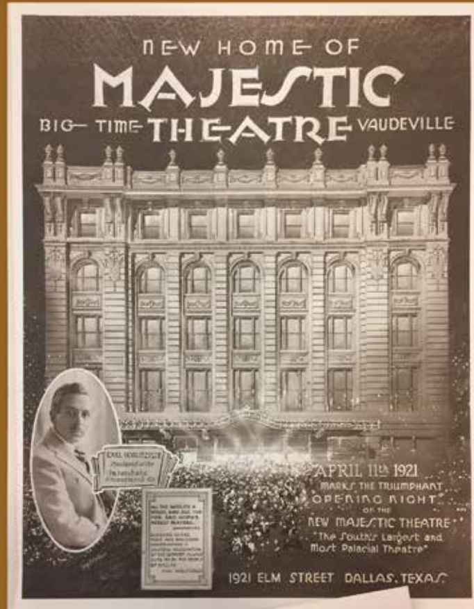
The Majestic Theatre opening night poster and program, April 11, 1921